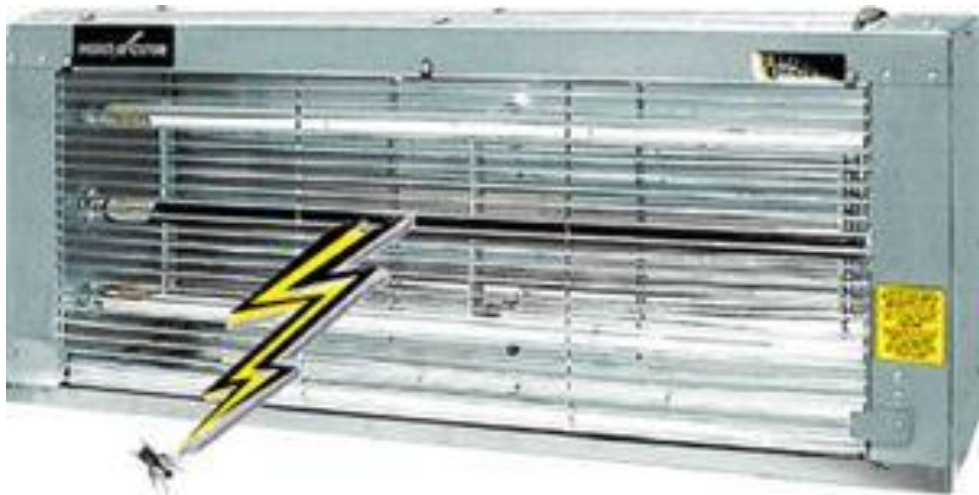
Animated fly being projected from electrocutor fly light.

Preventative action is always the best policy. Eliminating fly breeding sites will greatly reduce the dependency on fly lights. The steps are simple in eliminating the fly breeding spots, but they must be done repetitively to prevent future fly infestations.