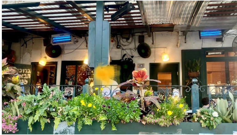
Electrocutors over dining room tables at nice restaurant.