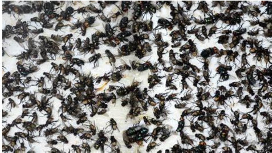
Flies on glue board.